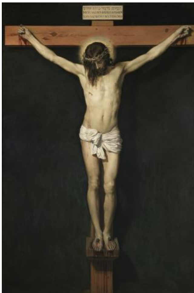
Diego Velázquez, Christ Crucified (1632)