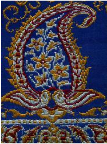
Persian silk brocade

The motif known (in English) as “paisley” originated in Persia. It resembles a fig, a twisted teardrop, or (by some accounts) a bent cedar tree. It was first used in conjunction with the Zoroastrian religion, but later appeared in garments and other fabrics used in many cultures in the Middle East and South Asia. Some early examples of paisley are set forth below: