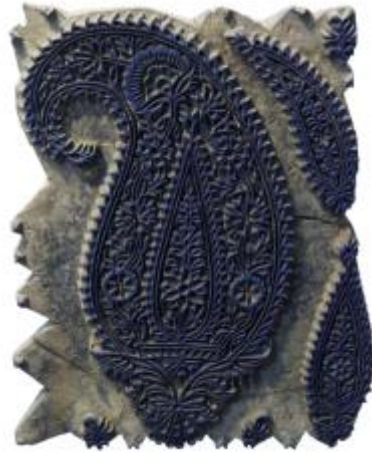
Handstamp for textile printing, Iran

Shawls and other articles of clothing featuring this motif were popular in Europe in the 17 th through 19 th century. Its use then waned until the 1960s, when, partly because of the influence of The Beatles, it became associated with the counterculture in the United States and England – and specifically with the use of psychedelic drugs. Some examples of modern fabric designs that include the paisley motif appear below: