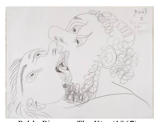
Pablo Picasso, The Kiss (1967)