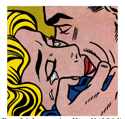
Roy Lichtenstein, Kiss V (1964)