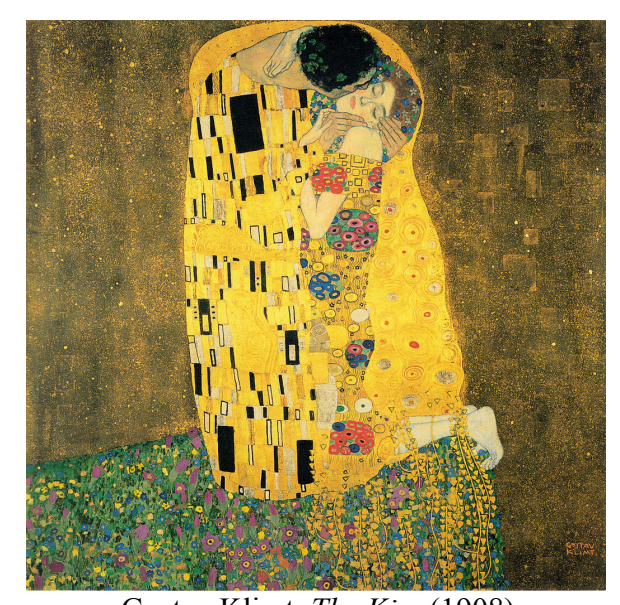
Gustav Klimt, The Kiss (1908)