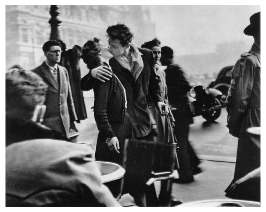
Doisneau, "The Kiss by the Hotel de Ville" (1950)

The photograph shown below was taken by Robert Doisneau in 1950 in Paris.