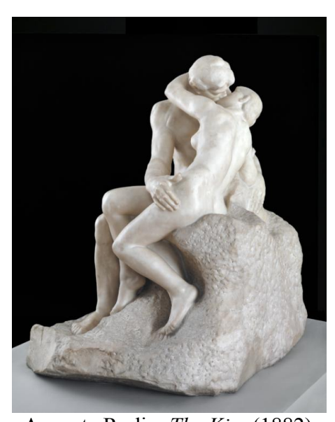
Auguste Rodin, The Kiss (1882)

For centuries, artists, working in a wide variety of media, have been depicting kisses. A few of the major works in this tradition are shown below.